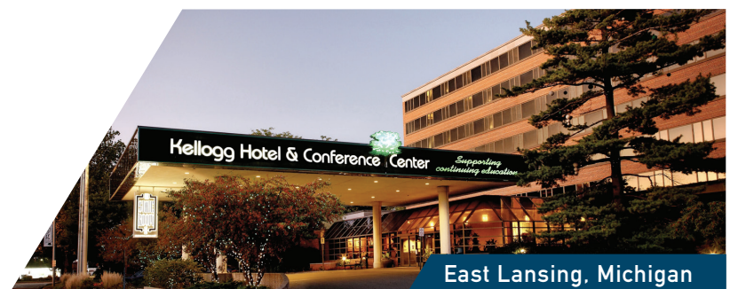
East Lansing, Michigan